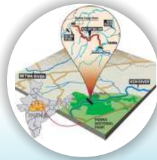
Ken-Betwa link Project